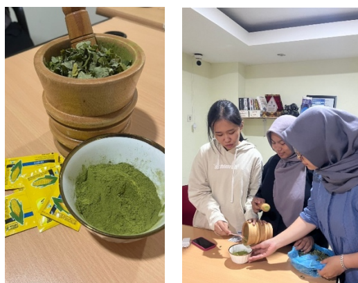
Figure 1. Refining Moringa Leaves