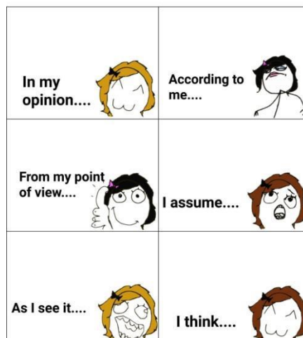
Image 1.2 Mematic art learning media