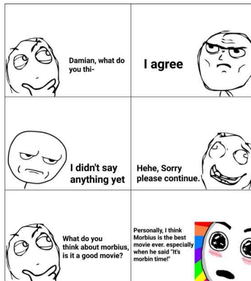
Image 1.4 Mematic art