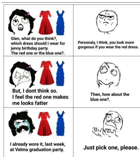
Image 1.5 Mematic art