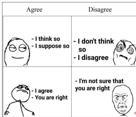
Image 1.3 Mematic art