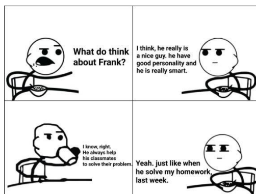
Image 1.6 Mematic art

After through validation process by the experts of speaking skill and learning teacher media, they approved the mematic arts rage comic model is suited to delivers the learning material to the students.