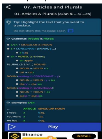
Picture 1 Note and Guideline of Speedy Grammar

Student should have a good team work in this session to make sure win the game and finished the sentences correctly. The teacher make group consist 4 until 6 students by using number therefore there students all student have a group by saying the numbers alternately. Each student have their job such as the students whose arrange the word into the sentences, as an administrators and written the result on sheet of paper.