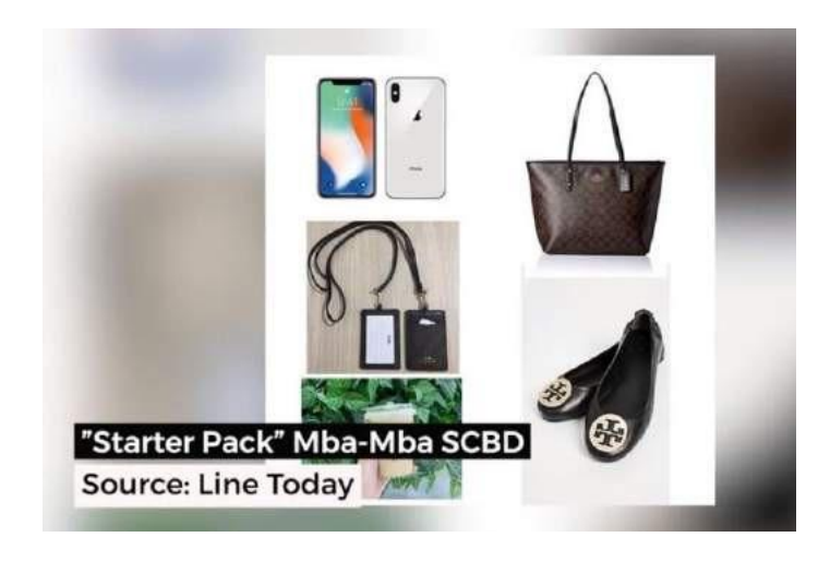
Figure 10. Items of SCBD Starter Pack

With a lifestyle that is above economic capacity, they get recognition, even though the actual conditions are not what they show off. They are willing to spend their money just to buy items that are identical to the upper class in order to be recognized as elite person too.