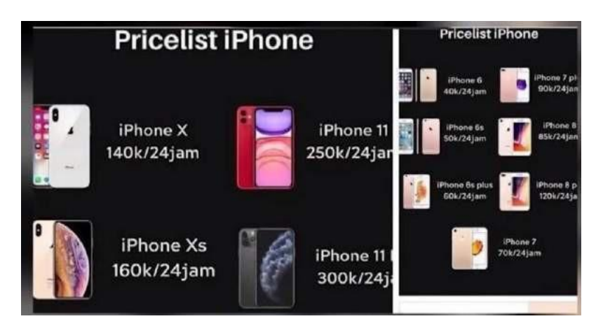
Figure 9. iPhone Rental

In order to increase their prestige, they are willing to spent their money to buy luxury items or rent luxury items that they don't really need. In the context of flexing, falsehood mingles with authenticity. This situation makes modern society become excessive in consuming everything not to fulfill needs, but the influence of simulations that cause changes in people's lifestyles to be different. So that they are financially incapable of consuming various things so that they are fulfilled. For example, they rent an iPhone for 24 hours, with various rates, according to the type. They rent iPhones just to show off.