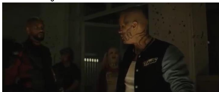
Picture 1 - El Diablo finally using his power to help the team

The character education value of being trustworthy is seen from several occasions between the characters of Suicide Squad . Trustworthy itself refers to the value where an individual is dependable for being honest, truthful, and responsible towards other people. An individual who is trustworthy is expected to always fulfill their responsibility and stick to their words. As defined by Ministry of Education and Culture Republic of Indonesia for the year 2020-2024, the character education value of trustworthy is included in the category of noble character towards human beings in Profil Pelajar Pancasila. Thus, the representation of trustworthy as one of the character education value identified from the film is appropriate to be applied as an alternative teaching media as students reinforces the content of film more preferable in the recent time and society. The value of being trustworthy is reflected by the characters in Suicide Squad as seen in the following scene and dialogues: