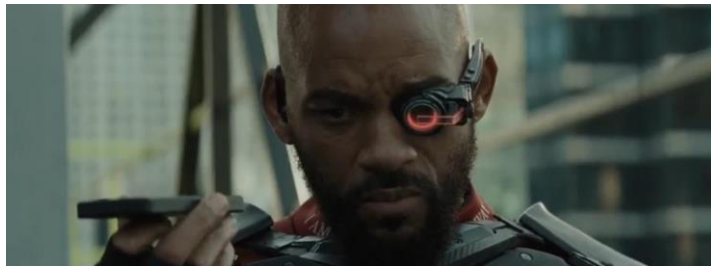
Picture 4 - Deadshot in the middle of transaction