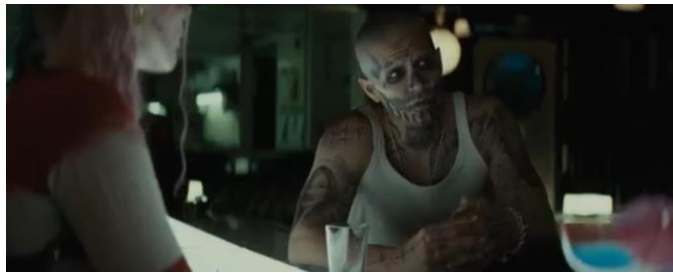
Picture 3 - Diablo empathizing with Deadshot

Ministry of Education and Culture Republic of Indonesia, the category of mutual cooperation includes the aspect of empathy where the individuals are expected to care about each other and pro-active in order to create excellent teamwork. The scene with the evidence of empathy is in the following,