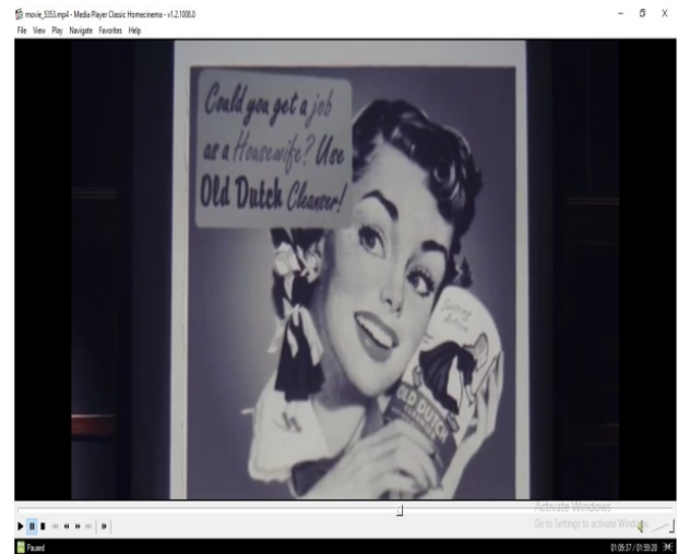
Gambar 3. Setting of Social 1

men were always given privileges. Even women were often related with some of advertising household products. Such as product from Old Dutch cleanser and Del Monte (Picture 3). From the Picture 4, it can be described that