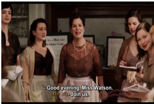
Gambar 2. Setting of Place 2

It can be seen from the assumption of most the students and all the elements in the school. Women in real life would just be a housewife, served their husband and children, and also worked in the kitchen. Even those seem like the big dream that have to be attained for women. Furthermore it was like the women obligation and the sanctuary for them. So that, they did not need to get the high education. Meanwhile man must got the high education because they would be a leader.