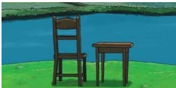
Figure 4. Visual of Riverside Chairs Tables

Symbolizes the peace of life and thoughts that are far and wide.