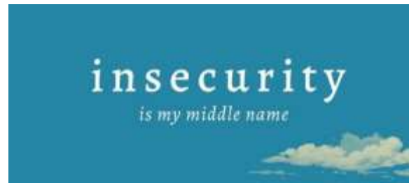
Figure 2. Visual Title Font in The Sky