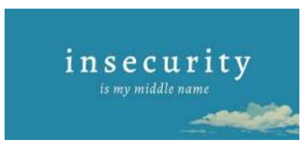
Figure 2. Visual Title Font in The Sky