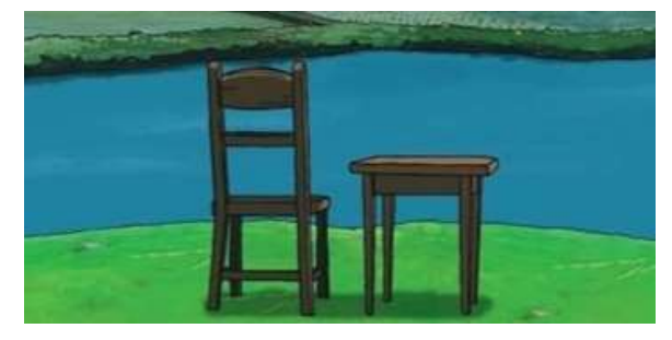
Figure 4. Visual of Riverside Chairs Tables

Symbolizes the peace of life and thoughts that are far and wide.